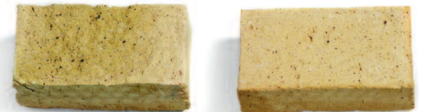
Coal-fired brick from Petersen Tegl. The pore formation is optimum, and no frost damage will occur. Broken | Cut