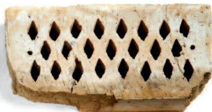
Perforated brick with frost damage