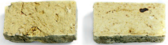
Brick from Nørholm Watermill. With its optimum pore structure the brick has been impervious to frost damage for more than 200 years Broken | Cut

In an electron microscope it is possible to see that the clay minerals are in the form of plates and discs. When water enters the space between these, forces occur which keep the clay plates – discs – together, and the clay may be formed into bricks, tiles, etc. To simplify this effect one may say that two, dry glass plates – discs – can be separated. If water enters the space between them, they 'stick' together, but allow shear.